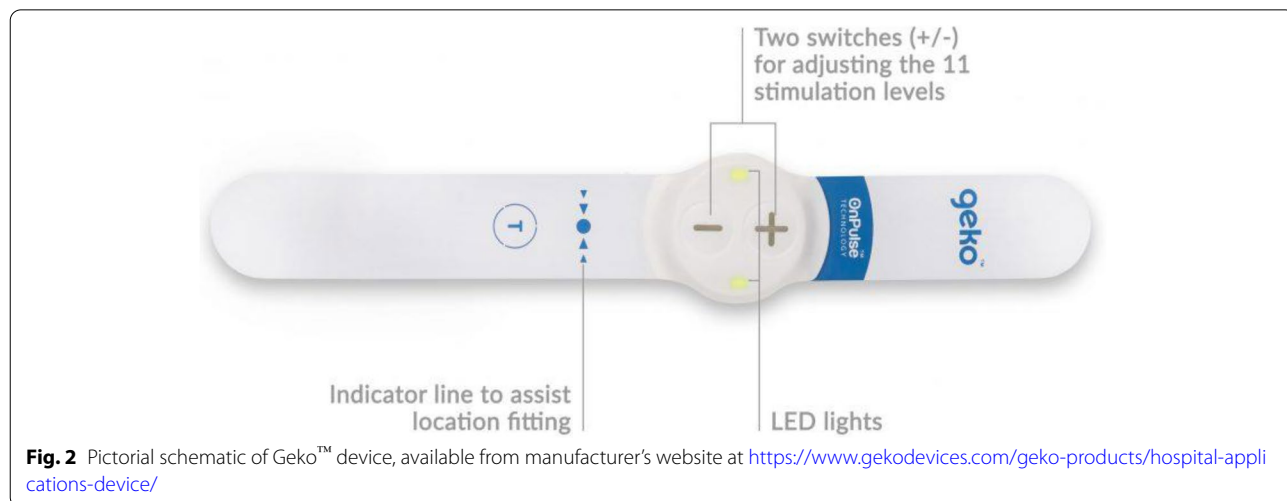
Fig. 2 Pictorial schematic of Geko™ device, available from manufacturer’s website at https://www.gekodevices.com/geko-products/hospital-applications-device/