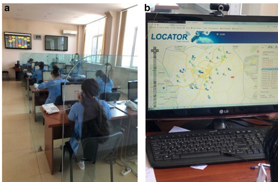
Fig. 3 Yerevan central dispatch. GPS locator for calls (left) and 1-03 operators (right)

The ethnically Armenian, Republic of Artsakh to the west of the Republic of Armenia remains in a “frozen conflict” with Azerbaijan, and for reasons of national security, neither ambulance services nor the specifics of hospital-based emergency services will be discussed in