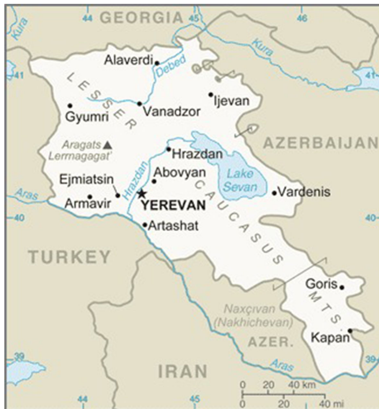
Fig. 2 Republic of Armenia [36]

Besides meeting the everyday health needs of the population, a well-organized, prepared, and resilient emergency care system has the capacity to maintain essential acute care delivery throughout a mass casualty,