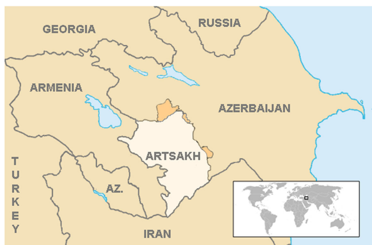
Fig. 4 The Republic of Artsakh [40]

Ideally, emergency medicine will develop in Armenia as a specialty; however, there are advocates of preliminary efforts to embed the emergency medicine curriculum in