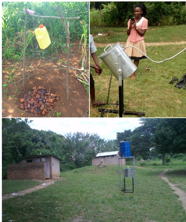
Fig. 2 Traditional tippytap (left), and an improved tippytap developed by students (right), 2016

competencies, and proposed an intervention to aid the community. Specific technical competencies acquired included Monitoring and Evaluation of OHCEA Field Attachment 2017 and Amref-Health Africa; data analysis at the Uganda National Laboratory Systems involving disease investigation; risk analysis and mapping disease hotspots and zoonoses with the Food and Agriculture Organization; Human Centered-Design-Thinking with the Resilient African Network; drafting training manuals on antimicrobial resistance and assessment of bio-risk management with the Infectious Diseases Institute. In addition to their experiential training and participation in field activities, each One Health fellow was asked to offer routine services of the organization in which they had been placed under close supervision and guidance of the organizational field supervisor. Some of these placements then led to long-term work opportunities for participants by linking them or absorbing them into organizations involved in their fellowships. A summary of the graduate fellow completion statistics is shown below (Table 2).