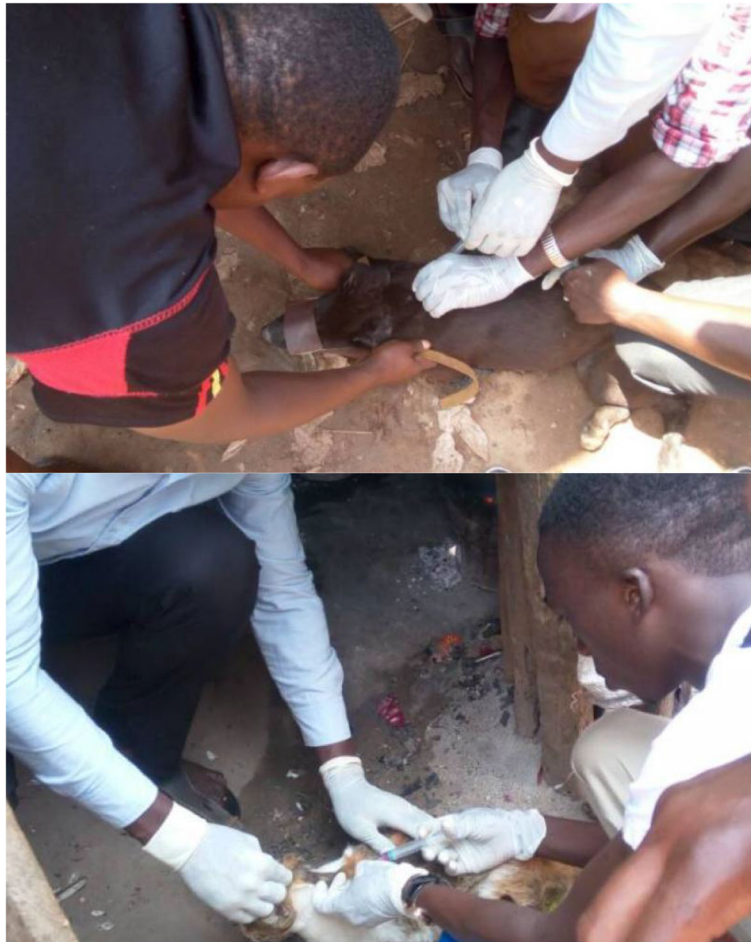
Fig. 1 Students One Health Innovation Club members during a vaccination campaign in some areas of Kampala city, 2017 that won a global competition in One Health

apply taught course concepts. In the attachments, groups of students from different disciplines were assigned to one of the eleven One Health field demonstration sites in Uganda for a period of 2–4 weeks. Students conducted problem prioritization and stakeholder identification and engagement, and developed daily action plans through student-led discussions. They were required to carry out projects aimed at addressing a community problem using limited resources, during which all students worked together to suggest appropriate interventions grounded from their disciplines, as well as implementation of a multidisciplinary solution. Highlights of projects from these placements include: using locally available resources to develop repellents to expel bats from infested households and institutions; water treatment systems for use at the household level; and novel hand washing facilities. In another example, a food market in Hima Township of Kasese District had a problem of accumulated charcoal dust residue. In response, a team of students led a community session on how to