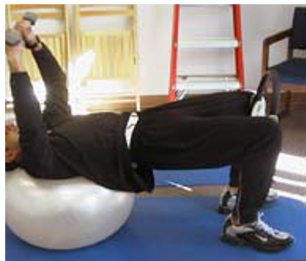
Figure 2 Bridging with shoulders on a ball.