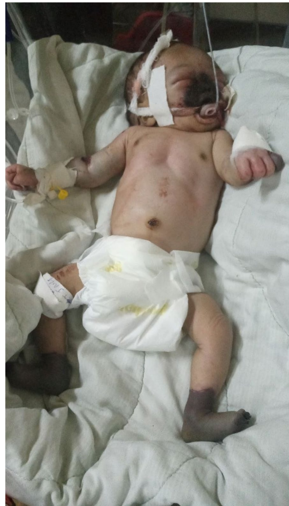
Fig. 1 Shows dry darkish discoloration of the entire nose, upper lip, bilateral feet, and distal legs, and left the fifth finger. There is also a bluish discoloration and swelling of the right elbow joint due to subcutaneous hematoma after removal of intravenous cannula site (Mobile phone picture taken on 5th day of admission)

had cold and dark discoloration of the feet and distal legs up to 4 cm proximal to the medial malleoli bilaterally. In addition, the left fifth finger was dark up to the level of the metacarpophalangeal joint, as shown in Fig. 1. Dorsalis pedis arteries were not palpable on either side. There was no blistering or crepitation over the dark areas. The skin was doughy with a very slow skin pinch. He was lethargic with depressed primitive neonatal reflexes. The remainder of physical examinations was normal. Random blood glucose was 380 mg/dl at arrival at the hospital. On complete blood count, he initially had neutrophilia and later progressive pancytopenia. The coagulation profiles were deranged. As