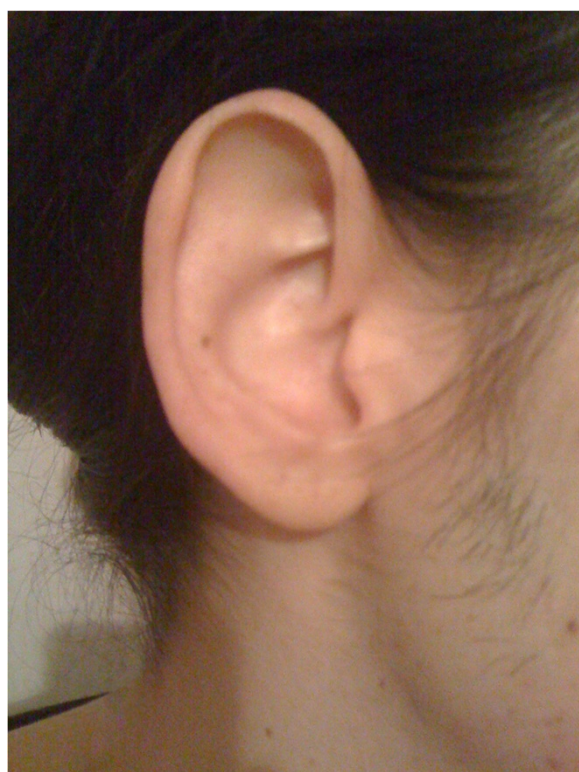
Figure 1 Normal appearance of the right ear of the patient (photograph taken by patient).

These symptoms caused our patient considerable distress, resulting in weekly attendance for three months at her general practitioner's clinic, in addition to presentation at the local emergency departments and to ear, nose