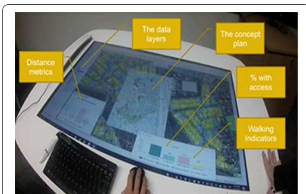
Fig. 2 PSS interface, developed using CommunityViz, used at the community consultation