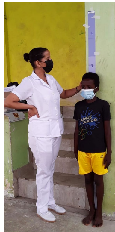
Fig. 1 Study staff checking number of tablets to be administered according to the tablet pole

The tablet pole was supplied by the WHO. It identified four height intervals, each one corresponding to a dose of ivermectin going from one to four tablets. The study staff registered height, weight and pole interval of each enrolled child (Fig. 1). InsudPharma & Mundo Sano