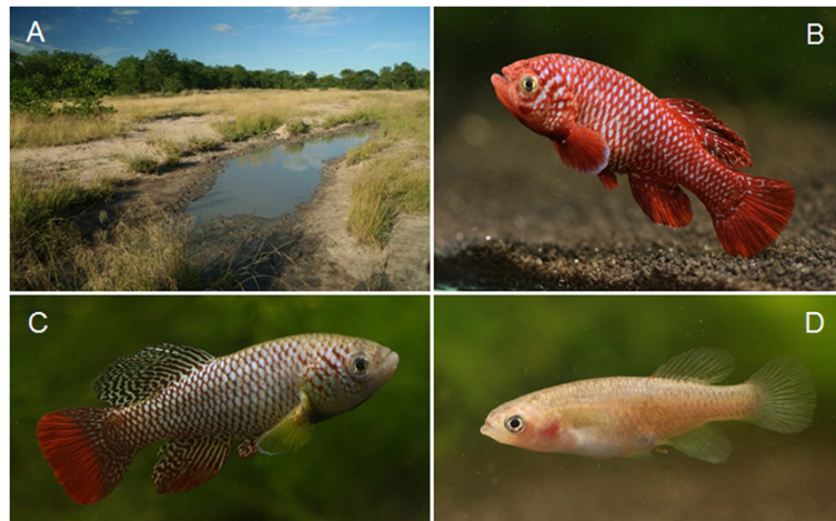
Figure 1 Study species and their typical habitat. (A) Typical habitat of the study species: a shallow savanna depression filled with water during the rainy season in Chefu region. (B) Male Nothobranchius kadleci . (C) Male Nothobranchius furzeri . (D) Female Nothobranchius kadleci .

(temperature 24.8 to 25.8°C). At eight days fish were transferred to 60 L tanks (27 to 28°C) with internal filtration. From the age when sex was discernable (11 to 14 days) until 21 days, the sexes were separated to avoid intense male sexual harassment [11]. Fish density was reduced to four males and eight females at 21 days and two males and four females at 42 days to approximate population densities in the wild.