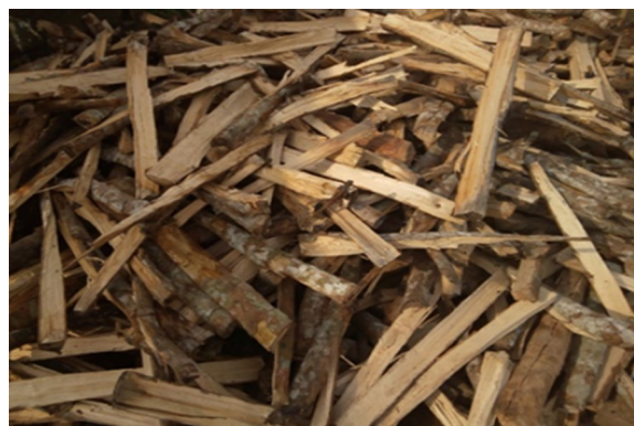
Fig. 4 Stock of white wood in front of a bakery

shows a gas oven that has been adapted to use wood. Figure 7 shows a gas oven installed at the time of the bakery installation. A few months later, this oven was converted for the use of firewood as shown in Figure 8. This work was done by technicians.