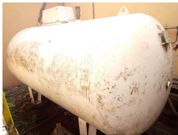
Fig. 5 Gas bottle of a bakery with a capacity of 1t 360 kg

shows a gas oven that has been adapted to use wood. Figure 7 shows a gas oven installed at the time of the bakery installation. A few months later, this oven was converted for the use of firewood as shown in Figure 8. This work was done by technicians.