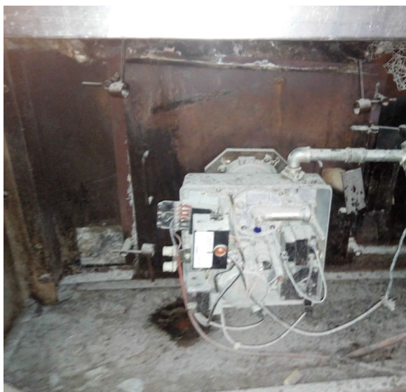
Fig. 7 Gas burner