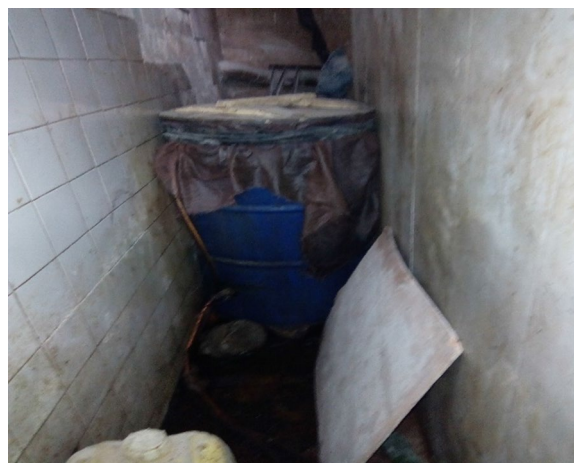
Fig. 6 Barrel of diesel