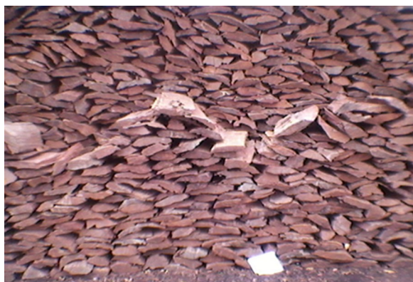
Fig. 3 Stock of red wood in front of a bakery

Modern furnaces require skills and availability of bakeries materials. For this purpose, it assumes that the bakery activity requires theoretical and practical training. Without these skills, the bakers prefer using wood. They adapt the oven to use wood instead of gas or gas oil. The operation of the equipment for the use of conventional energies carries risks according to the bakers. For example, Fig. 5 presents a normal gas oven, whereas Fig. 6