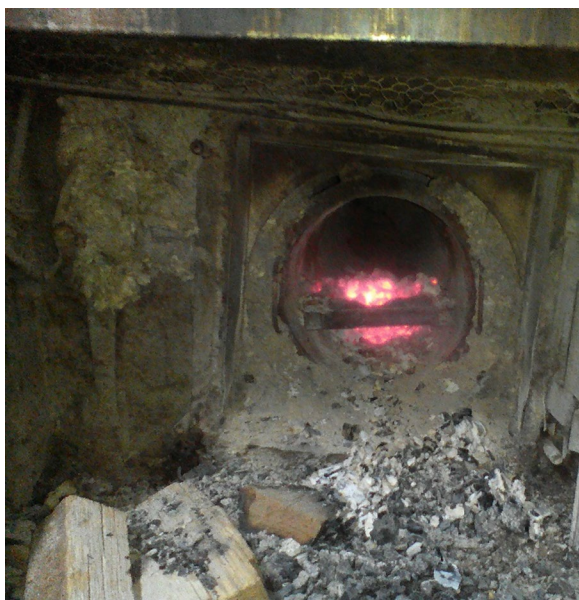
Fig. 8 Wood fireplace

"The gas connection must be done by a qualified expert who will ensure the proper gas supply and a good adjustment of burner combustion. These installation operations that you see there, are very delicate and essential for the oven to work without too much trouble." (A baker in Koumassi).