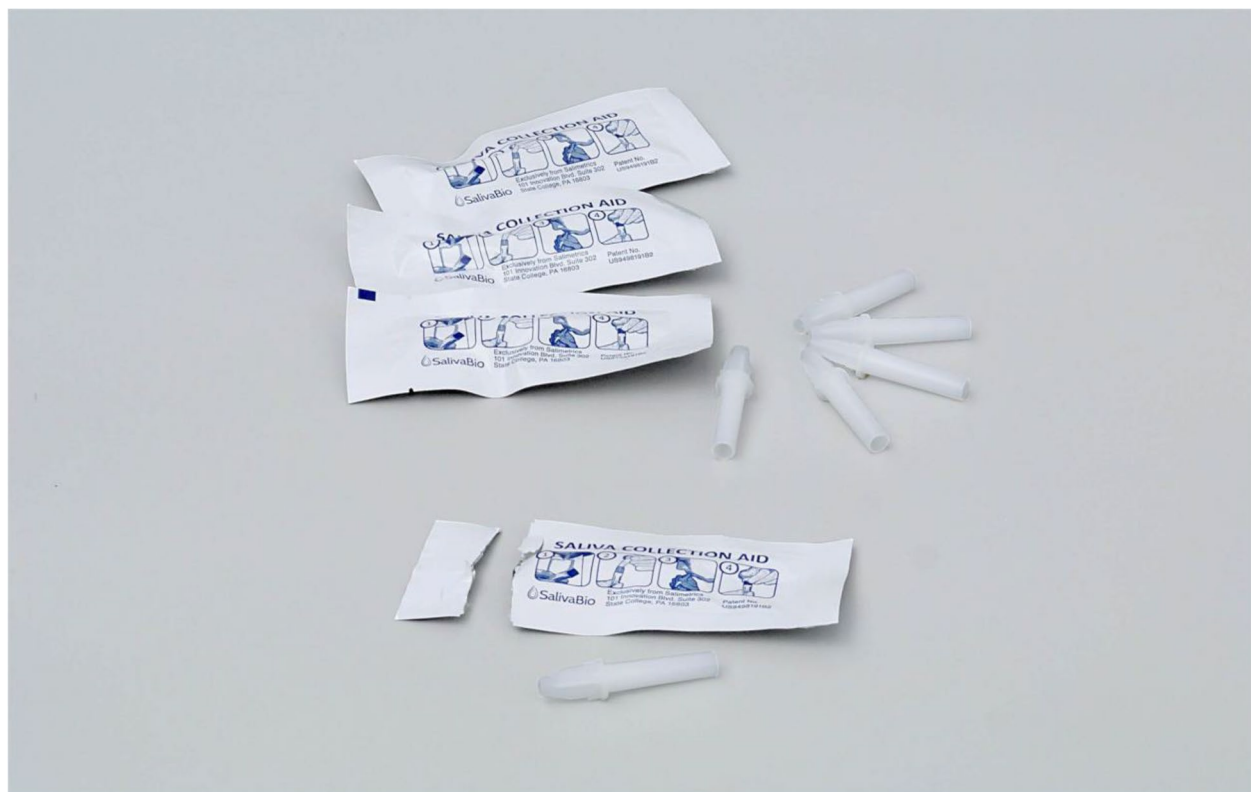
Fig. 1 Saliva collection aids and cryovials.

a saliva sample, the participant was asked to seal their sample, return it to their resealable plastic bag, and place the bag in the refrigerator. We told the participants that if they fell ill within the 24 h of our home visit that they contact the research team to collect their saliva samples on another day when they were healthier. Fortunately, none of the heads of household became ill during the study.