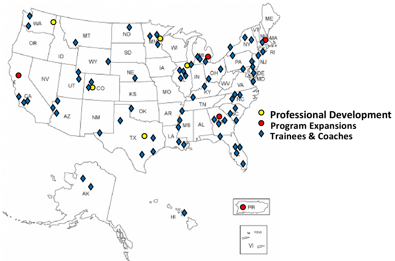
Fig. 2 National Presence of Professional Development Core. NRMN's Grantwriting and Professional Development Programs' expansion. Original location of NRMN Grantwriting and Professional Development Program sites (yellow circle); new expansion sites (red circle) and location of Mentees and Coaches-In-Training (blue diamond) across the United States