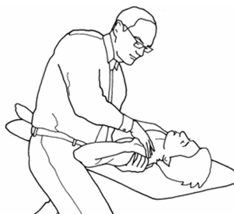
ULNT ULNAR (3)