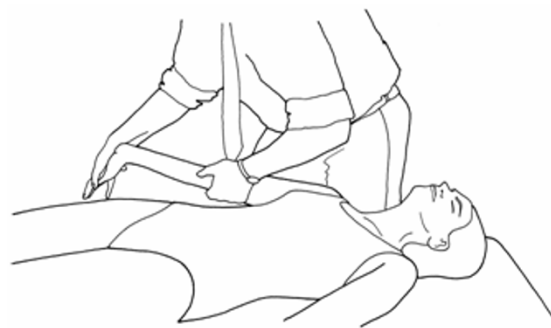
ULNT MEDIAN (2a)