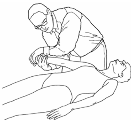
ULNT RADIAL (2b)