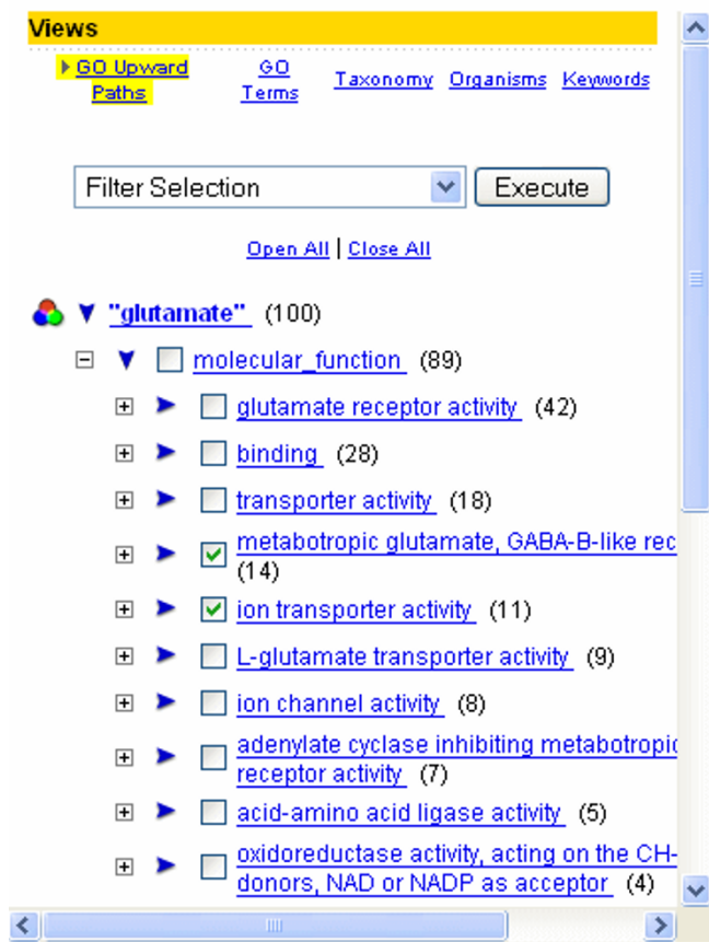
Figure 2 Selecting clusters on one view. This figure details the "Go Upward Paths" view for the query of Fig. 1. Here the user can select specific clusters to refine her search.