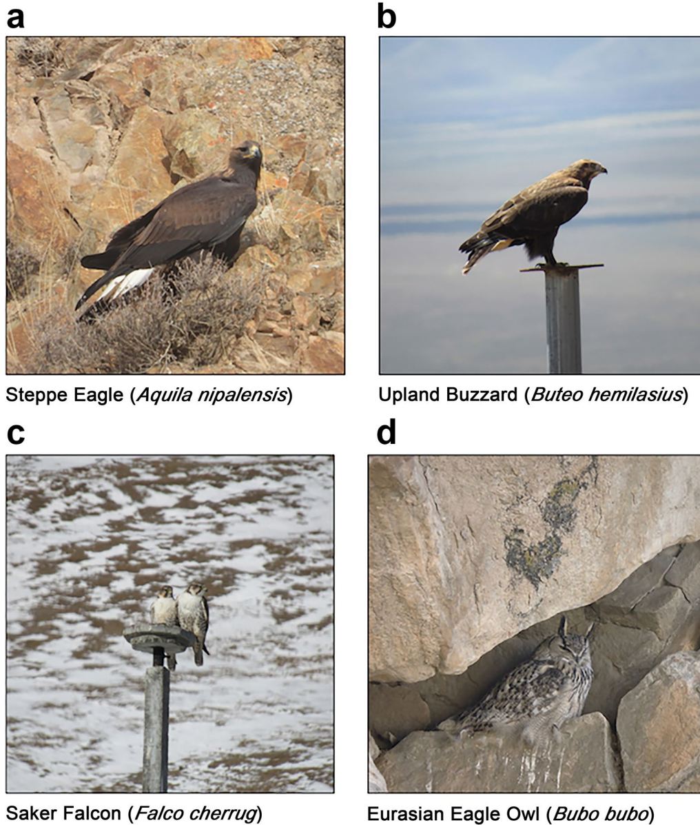
Fig. 2 The host bird species identified via DNA-metabarcoding of bird pellets collected on the Qinghai-Tibetan Plateau. a Steppe Eagle (photo credit: Jia Li). b Upland Buzzard (photo credit: Charlotte Hacker). c Saker Falcon (photo credit: Charlotte Hacker). d Eurasian Eagle Owl (photo credit: Munib Khanyari). Figure made in Microsoft PowerPoint for Mac version 16.42