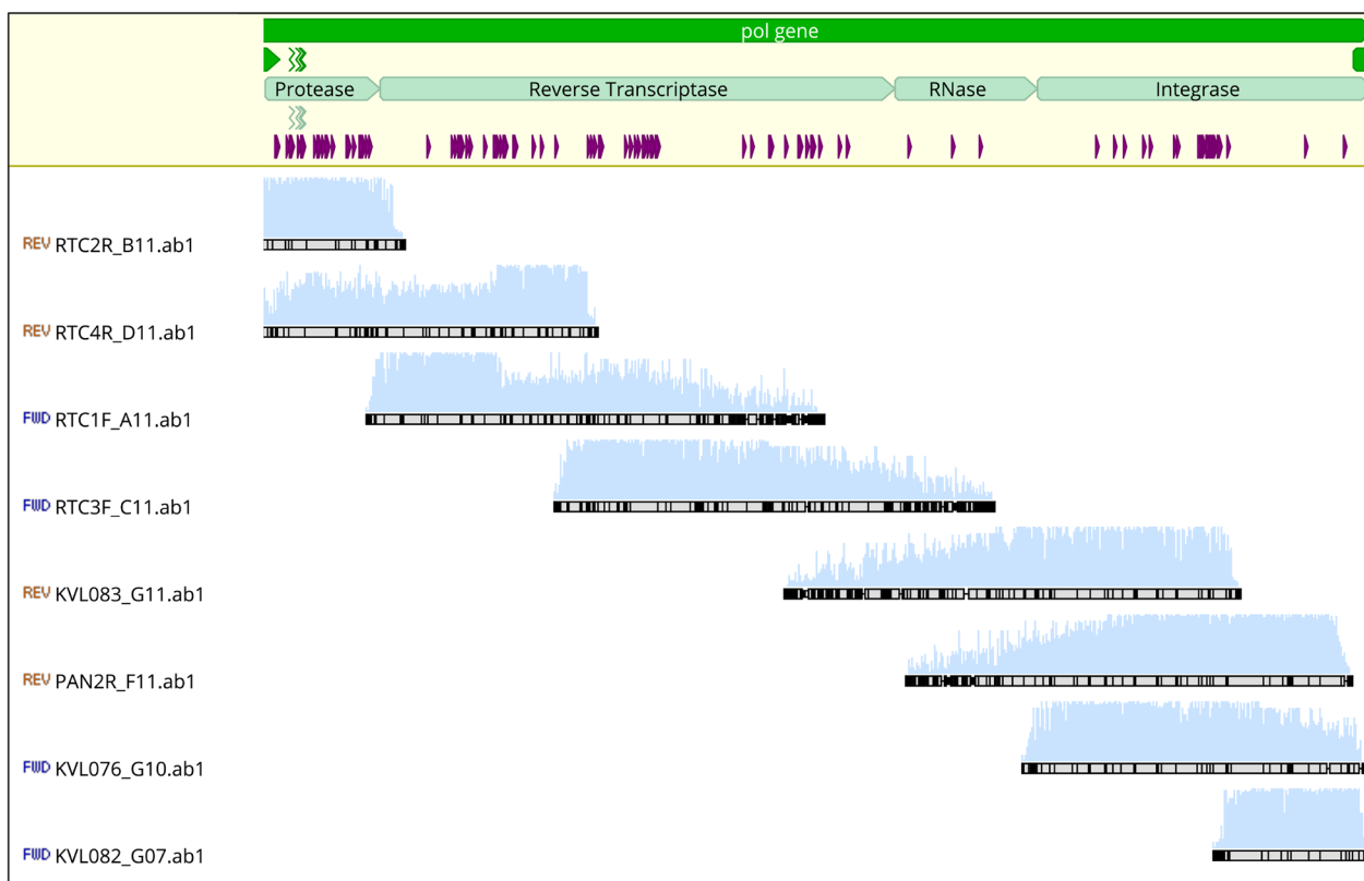
Fig. 2 Complete sequence coverage of PR, RT and IN genes with 8 sequencing primers

most common NNRTI mutations were K103NS (47/78, 60%) and V106AIMT (27/78, 35%).