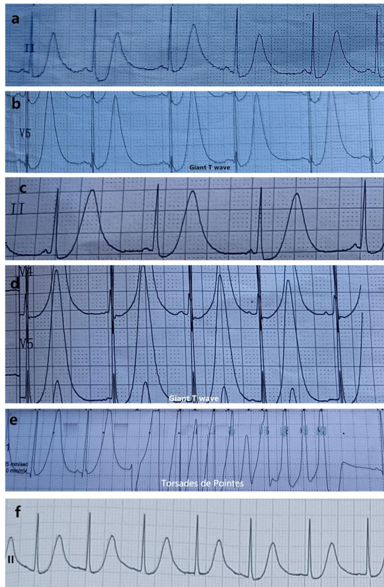
Fig. 2 ECG recordings at four different periods. QTT interval is often measured on lead II or V5. a, b QTc of 607 ms and huge T waves detected by ECG on August 12, and changes in the S-T segment. c, d QTc of 558 ms detected by ECG on August 19. e Holter ECG monitoring of Torsades de Pointes on August 19. f ECG revealed QTc of 458 ms on August 21