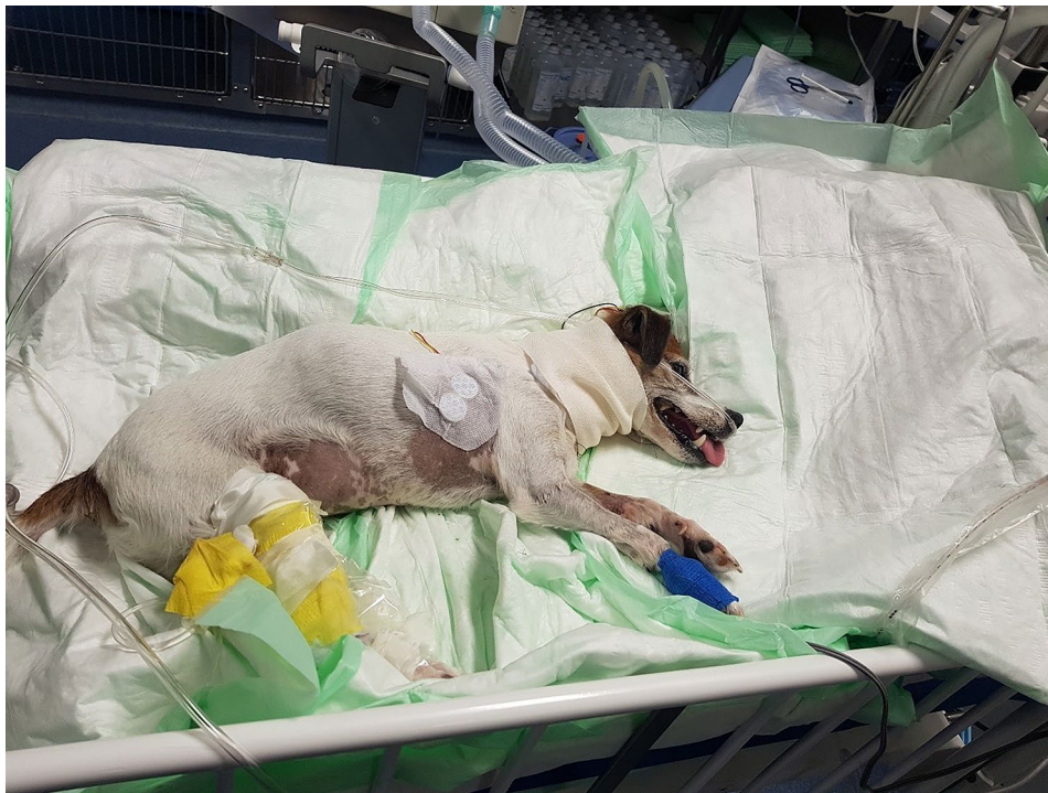
Fig. 1 The dog during a stay in the intensive care unit